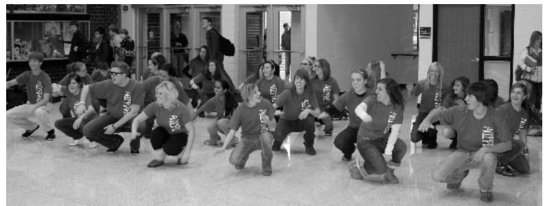
Above: The flash mob gets going!! On Thursday, November 17th, a flash mob of students in contemporary literature, leadership, and sociology did a flash mob to raise awareness of bullying. There is also a poster in the commons to sign.